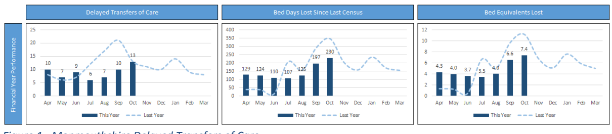
Figure 1 - Monmouthshire Delayed Transfers of Care

We saw a marked reduction in the number of delayed transfers of care (DTOCs) and bed days lost across all five local authority areas from June 2016 to September 2016. In this period, the Health Board as a provider subsequently reported 30% fewer delays compared with the same period the previous year. Performance in all local authorities deteriorated in October 2016, with Monmouthshire also reporting its highest number of DTOCs (13) since January 2016 (figure 1).